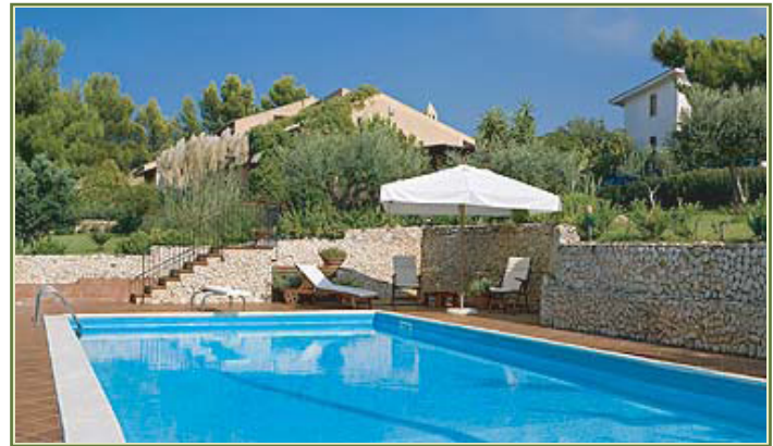
Villa Mimosa sleeps 8 people

Set in the idyllic area of Fraginesi and seemingly well off the beaten track you are in fact 1km drive from Calabianca where magnificent seascapes follow one another, leading to Guidaloca bay and nature reserve. The historic town of Castellammare del Golfo is only 3km from where small islands are only a short boat ride away.