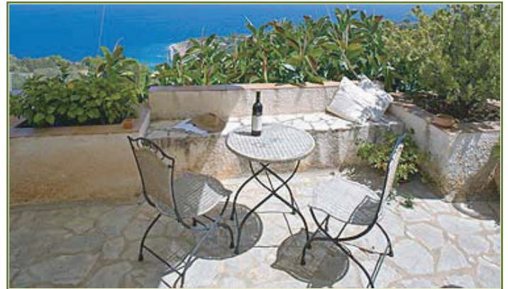
Villetta Scardina sleeps 5 people

Romantically perched on this stunning stretch of western coastline, there are breathtaking views towards Lo Zingaro nature reserve, which is a mere 500 metres away, with its azure sea and intimate coves. Full of light, Villetta Scardina is the ideal retreat for couples or a family wishing to explore this undiscovered area of Sicily.